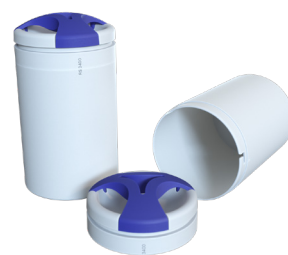
Standard Canister Container & Lid

*Each canister's internal volume is 1L without the Support Inserts and ~868mL with the Support Inserts.