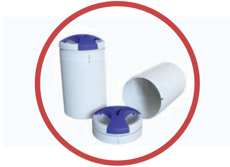
RS 3400 Canisters (2021) Standard Version