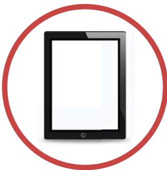
Rad Scan Bar Code Reading System