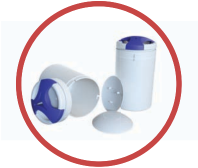
RS 3400 Canisters (2021) Dose Uniformity Optimized