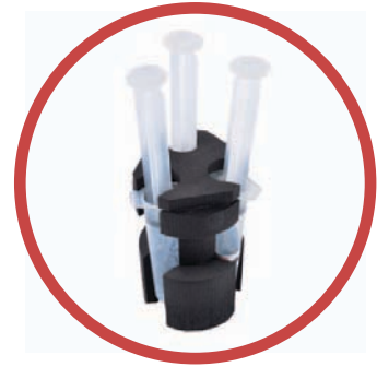
RS 3400 Syringe Holder